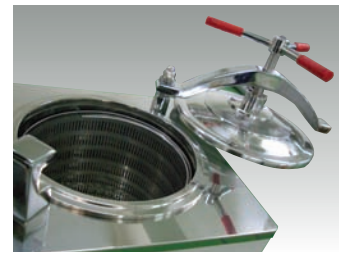
DK-AC 001 Lid