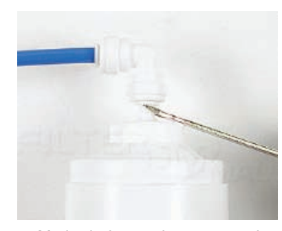
Method of removing one touch connector