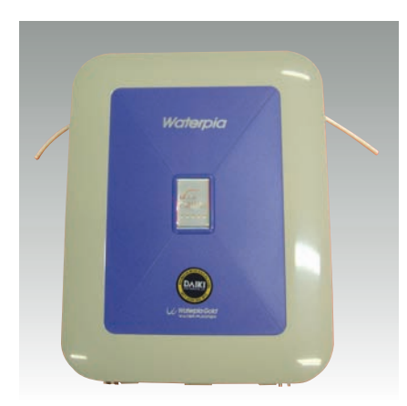
Drinkable Water Purification System