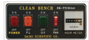
DK-TTCB 002 Controller

! The instruments have been tested in 220V, 60Hz power condition. There can be performance difference according as power condition of each country